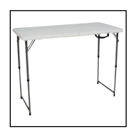
Step 5 Flip table over, and stand it on its legs.