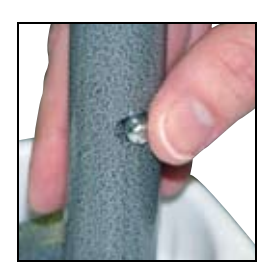
Step 4 (optional)

Pull legs out and up,until they are are straight up and down.